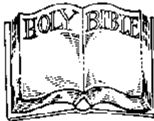
(Altar with Bible on Matthew 28, cross swords, Delta)